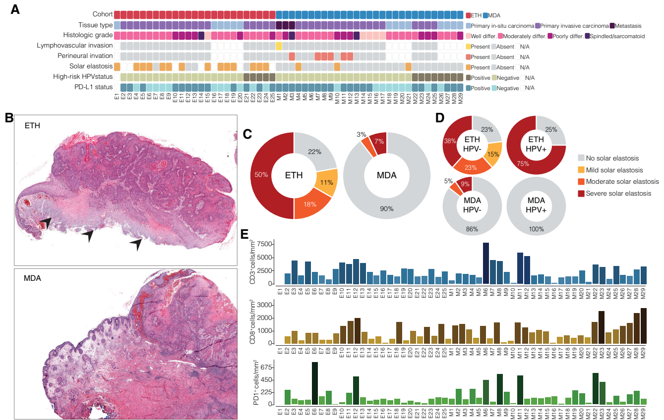
FIGURE 1. Histopathologic characteristics of samples in the ETH and MDA cohorts. (A) Cohort and histologic characteristics, showing country of origin (ETH, MDA), type of conjSCC (primary: in situ/invasive/ metastatic), histologic grade, presence of lymphovascular invasion (LVI), perineural invasion (PNI), conjunctival subepithelial/ stromal solar elastosis, high-risk human papilloma virus (HPV) status, and PD-L1 (tumor proportion score \geq 1\% ). (B) Histologic images of representative conjSCCs with severe conjunctival subepithelial/stromal solar elastosis ( arrowheads, top panel , magnification 10\times in the ETH cohort) and without solar elastosis ( bottom panel , magnification 10\times , in the MDA cohort). (C, D) Prevalence and severity of solar elastosis in the ETH and MDA cohorts (C) and by HPV status (D). (E) Density of tumor-infiltrating lymphocytes (average number of cells/mm 2 ) expressing CD3 ( top panel ), CD8 ( middle panel ), and PD1 ( bottom panel ). Each column corresponds to the sample in the corresponding column of panel A.

lower density of CD8+ and PD1+ cells ( P = 0.026 and P = 0.041 , respectively). Whereas CD3+ cell density was also lower among samples with solar elastosis, this difference was not statistically significant.